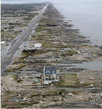
Galveston Texas Hurricane 2008