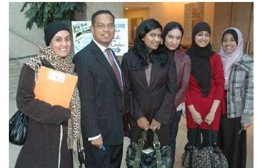
Congressman Keith Ellison, MCN, CAIR and MPAC