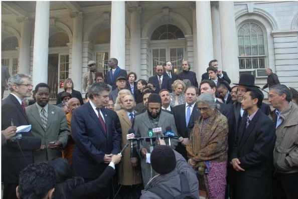
Muslim, Jewish and Christian leaders decry the terror attack in Mumbai, India: NY City Hall in December 2008

MCN is incorporated in New York State and is a 501C 3 non-profit. Donations are Tax Deductible.